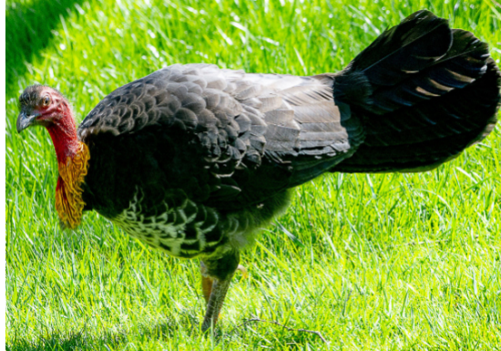
male Brush-turkey in Mt. Tomah, NSW in 2021 (Niel Carey)

Finding "scratched-up" earth was once a sign of a lyrebird but it may be a Brush-turkey - especially in gardens.