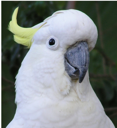
Feral? Who me? Sulphur-crested Cockatoo

The issue is more that it has displaced other species such as the endangered Gang-gang Cockatoo.